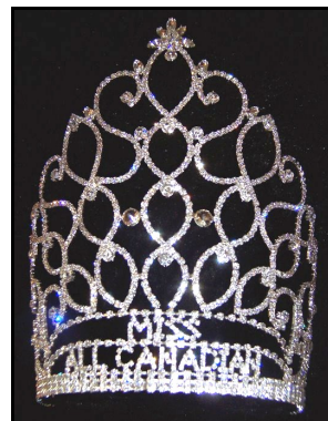
The 10" Rhinestone Tiara!

2nd & 3rd MOST AD SALES: The contestant submitting the second and third most ad pages for the program book will be featured on the inside front cover and be crowned Cover Girl or Boy and awarded their designated ad page prize package. They will also be in the draw for the diamond necklace Both 2nd & 3rd most pages will also be invited to the FREE Professional Photoshoot set up with Kris from Picture This Photography ( date TBA)