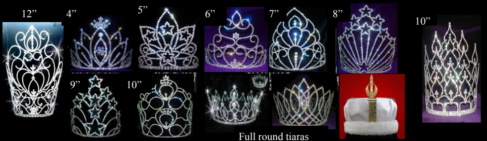
Full round tiaras