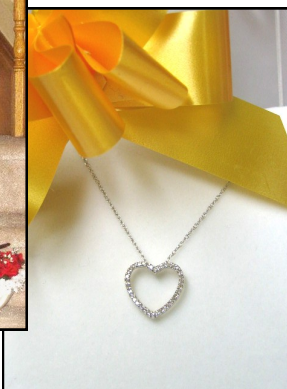
14K Diamond Necklace that can be won by obtaining just ONE ad page— Everyone with one ad page will be in the draw for this lovely necklace. 14K gold open heart value $295.00-Davidson's Jewelers