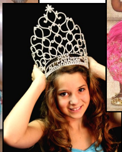
Savannah 2011 Supreme Queen showing the size of the Queen