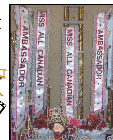
The custom sashes!